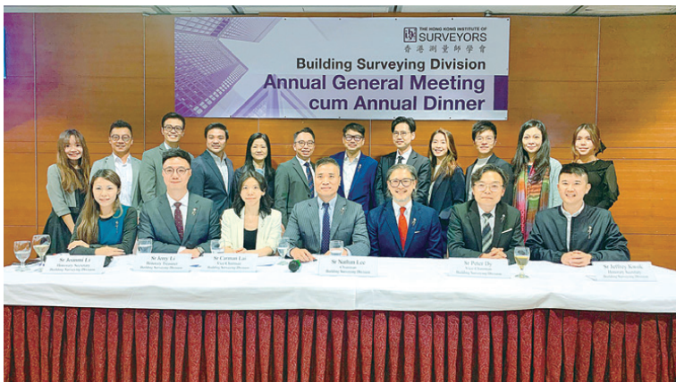
AGM & Annual Dinner

To unite BSs of different ages, careers, and specialties through the organisation of various activities such as roundtable forums, team