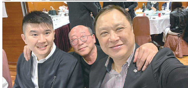
AGM & Annual Dinner

Recaps from my AGM speech include a call for the BSD's 1,646 professional building surveyors to help it strengthen its role in the market and society by followings four main practices: